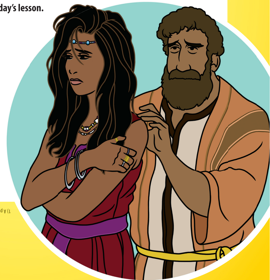
1) A prophet of God. 2) Take his wife back and love her again. 3) He loves them.